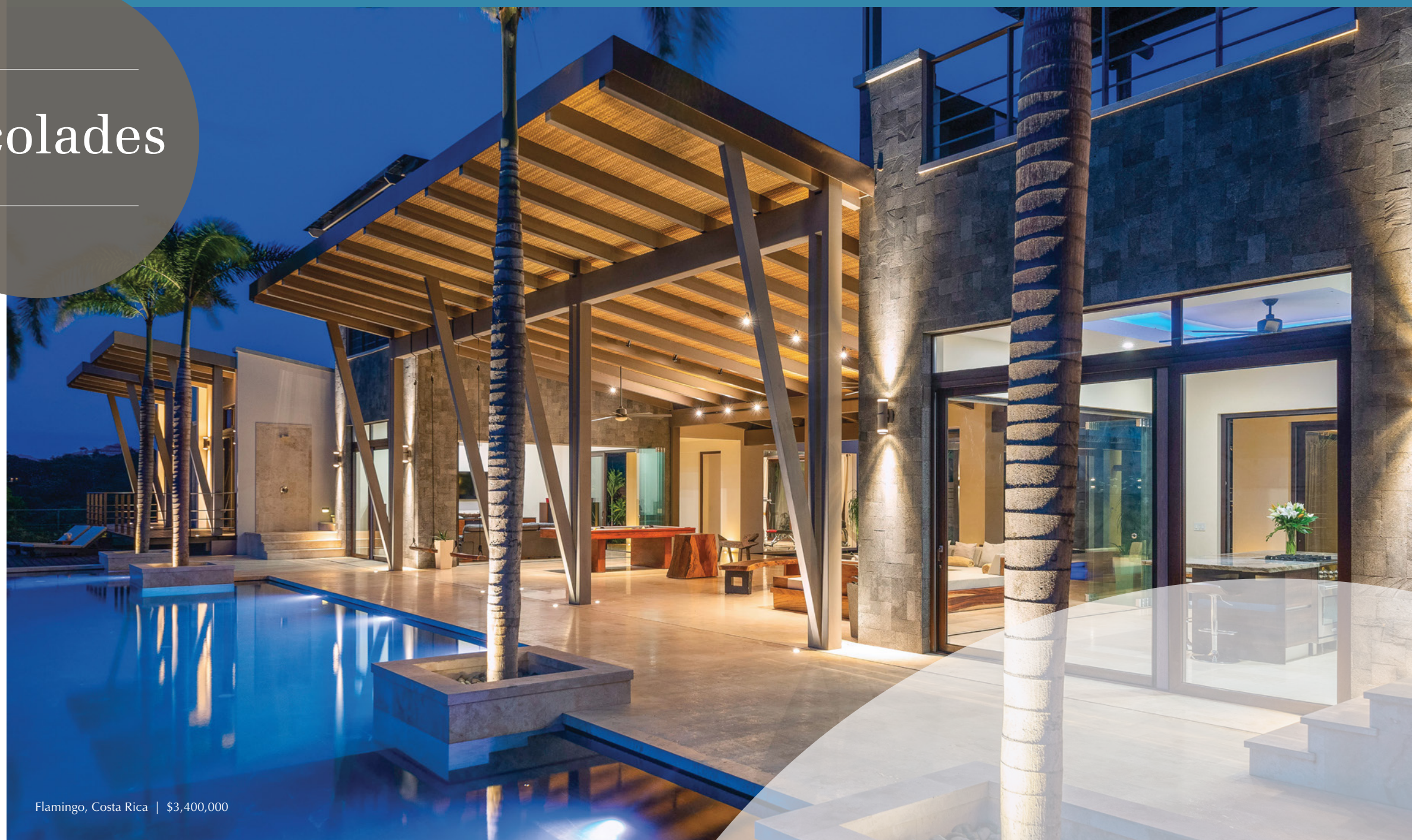
Flamingo, Costa Rica | $3,400,000

IADAS International Academy of Digital Arts and Sciences